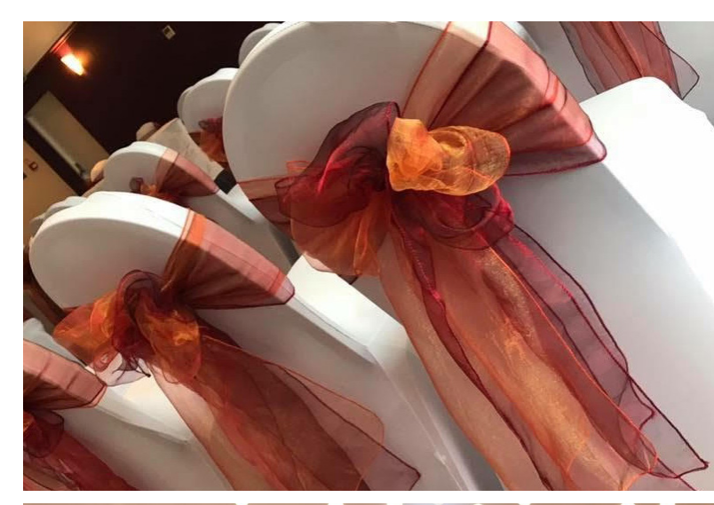
Top and bottom; photography courtesy of David Webb North East Wedding Photographer

It's often the little things that make your wedding unique which is why we offer the flexibility to add your own creative touch to your day. For example, why not add chair covers and sashes to your evening reception to match your colour theme. Our dedicated supplier will advise and tailor to your needs. We can also provide balloon clusters to complement your day. Just ask your Holiday Inn wedding coordinator how we can make your day that little bit more you.